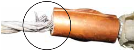
Cable fraying at swage contact point

(Swage may be located beneath rubber stopper)