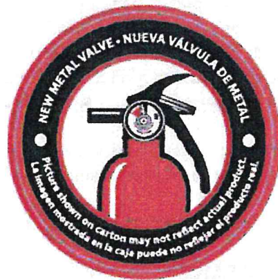
Found on the front and back of the box

As previously mentioned, Kidde is working closely with the CPSC, Health Canada and PROFECO, as well as the NHTSA and the USCG to determine next steps. Please contact your regional sales manager or customer service representative for an RMA or additional return information. We will continue to provide regular updates, as available.