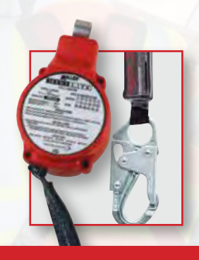
MILLER® MINILITE® FALL LIMITER