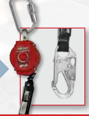
MILLER® TURBOLITE PERSONAL FALL LIMITER