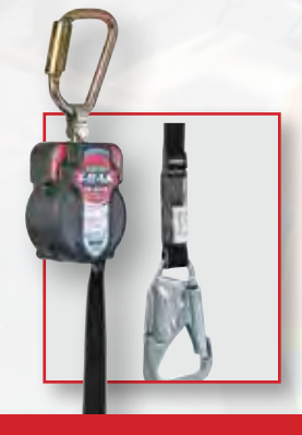
MILLER® TURBO T-BAK™ I PERSONAL FALL LIMITER