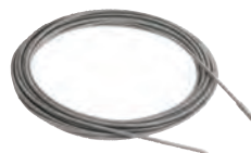
C-32 CABLE ( \frac{3}{8} " X 75') Cat. #37847