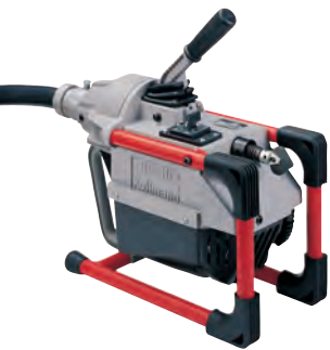
K-60SP (ALL MODELS)