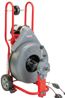
K-750 (ALL MODELS)