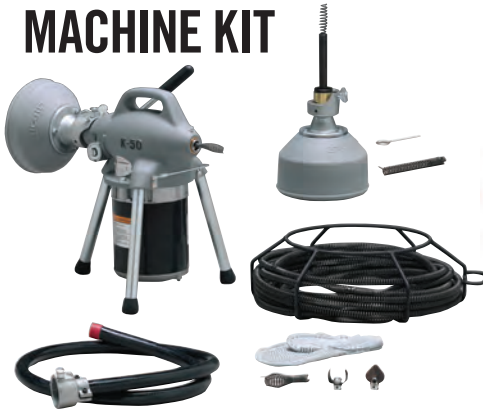
K-50 KIT (KITTED MODELS ONLY)