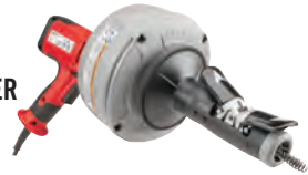
K-45 DRAIN CLEANER (ALL MODELS)