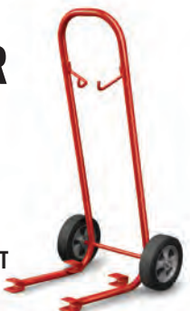
A382 TRANSPORT CART Cat. #55017