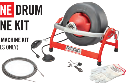
K-3800 DRUM MACHINE KIT (KITTED MODELS ONLY)