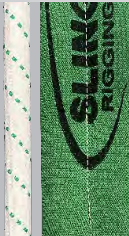
Width example of equal capacity Helix™ and Twin-Path® Slings