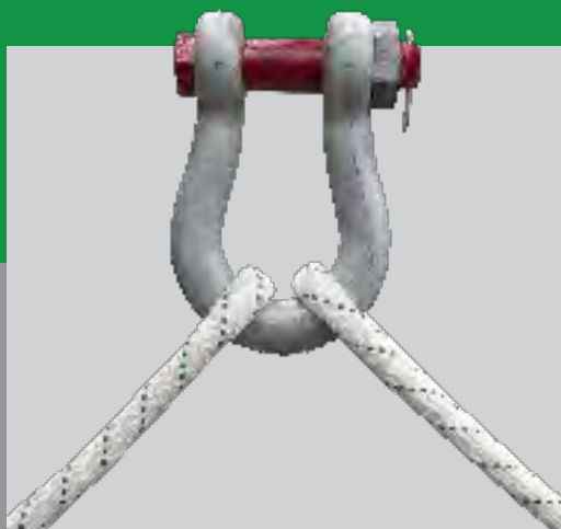
Helix8 500 scale example in 85t Crosby shackle