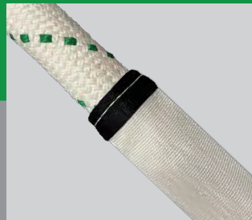
Helix™ is compatible with our Spider Sleeve Abrasion Protection