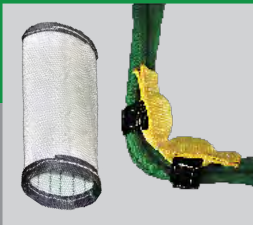
Helix™ is compatible with CornerMax® Pad & Sleeve Cut Protection