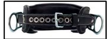
2D Lineman Tongue Buckle Body Belt

As part of 3M Fall Protection's continued commitment to producing high quality safety and personal protective equipment, we conduct periodic testing of our products. Recent testing of specific 3M™ DBI-SALA® Delta™ Seat Belt™ 2D & 4D Lineman Belts (see pictures to right) has returned unfavorable test results on some units. These Lineman Belts are certified to a variety of standards but specifically this recall applies to the compliance with the Canadian Standards Association (CSA) Z259.1-05 Section 6.2 and ASTM F887-13. This section requires the belt system to be dynamically tested to ensure the last tongue buckle belt grommet will hold up in a misuse situation or accident involving only one D-ring being connected. In recent internal testing, some of these models did not meet this dynamic test requirement. Because they are marked as meeting the CSA and ASTM F887-13 standards and we experienced the recent non-passing tests, 3M Fall Protection is issuing a recall for specific 2D and 4D models (see part numbers listed below) manufactured between Sept. 19, 2019 and June 30, 2020.