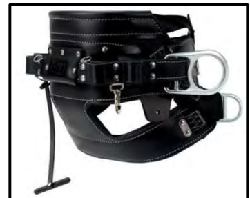
4D Lineman Tongue Buckle Body Belt

Please note: these 3M™ DBI-SALA® 2D & 4D Lineman Belts do meet the test procedures stated in OSHA 1926 Subpart "M", Appendix "D".