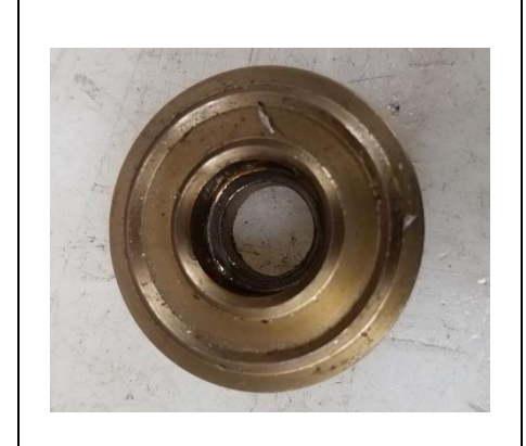
Self-Colored Pad – Non-Affected Part