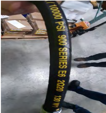
Potentially Defective Hose (yellow lettering only)