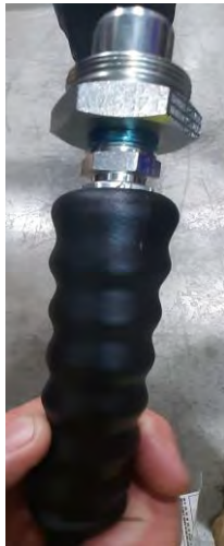
Rubber hand grip