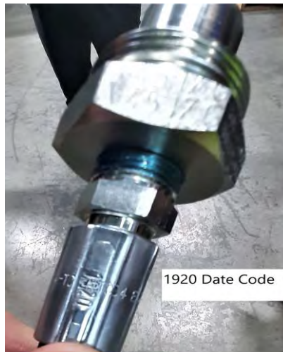
Example of defective hose date code

Please contact your local Tech Services Group and make arrangements to have these hoses replaced free of charge.