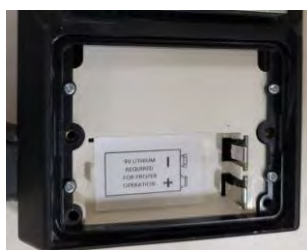
Figure 5 – Tester With Single Battery Compartment – Not Subject To Safety Notice