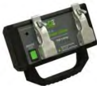
Figure 1 – RT-10 Rope Tester