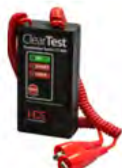
Figure 2 - CT-300 ClearTest Transformer Tester