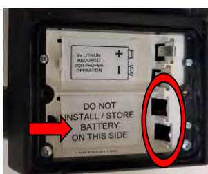
Figure 4 – Reworked Tester. Contacts Removed in One 9V Battery Compartment. Not Subject to Safety Notice.